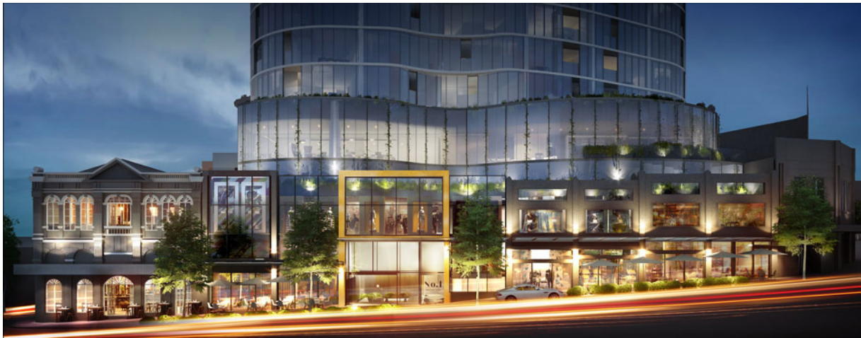
Artist's impression of FV's final tower No.1

Foresters restaurant and bar, a 180 seat venue has opened beneath FV’s Peppers resort in the heritage-listed Forester’s Hall. Foresters is a collaboration between FV developer Tim Gurner and Signature Hospitality Group.