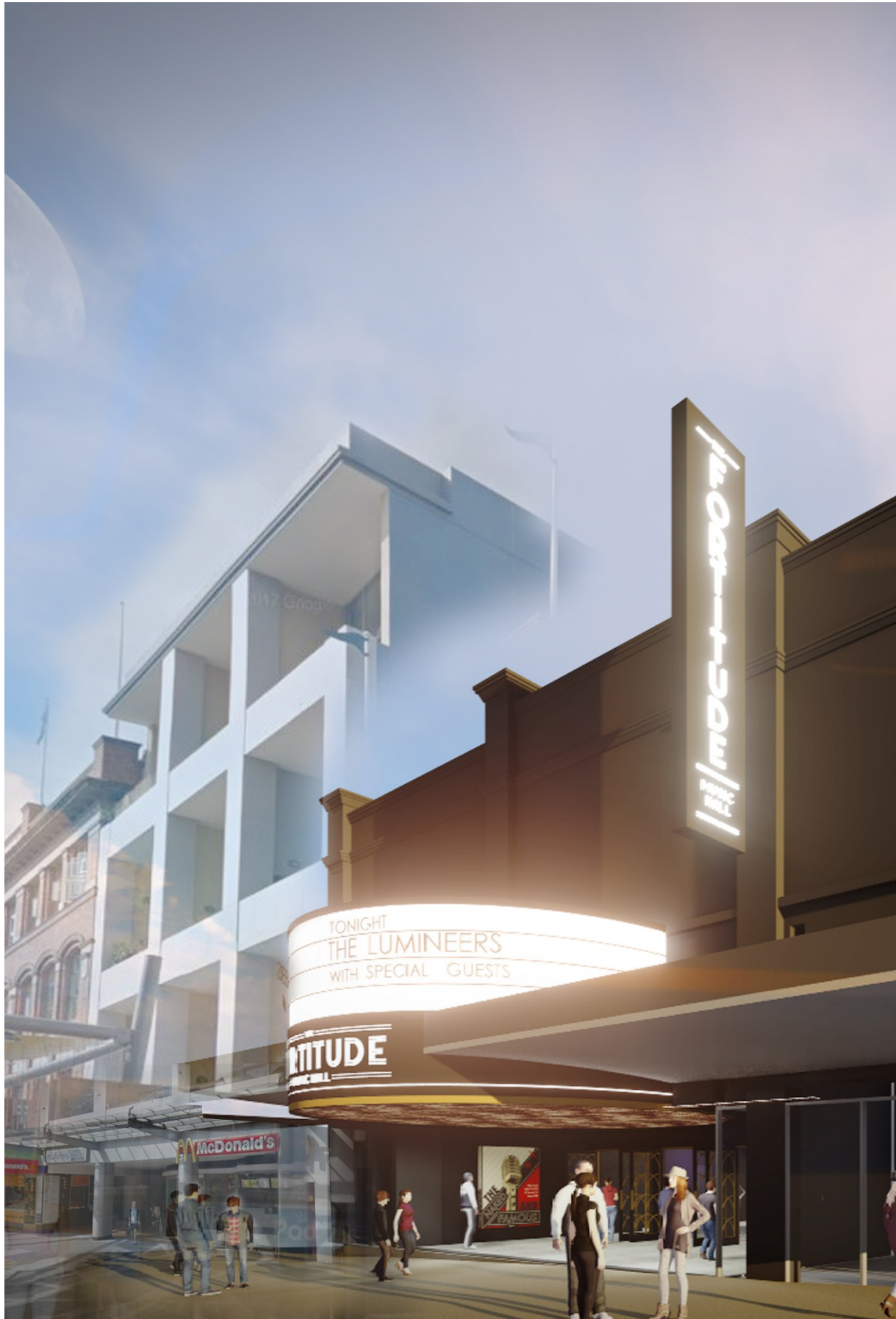
Artist's impression of the Fortitude Music Hall

This Friday, the long-awaited Fortitude Music hall, Brisbane's newest live music venue in the heart of the Fortitude Valley is officially opening.