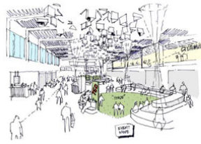
Urban Common in Event Mode