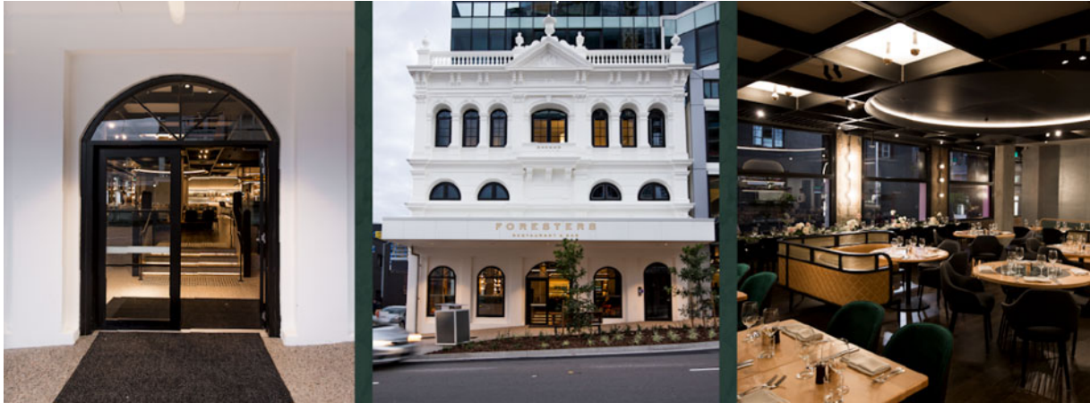
The new Foresters restaurant and bar below FV

FV’s third and final tower ‘no.1’ has been completed which has brought new retail offerings on street level.