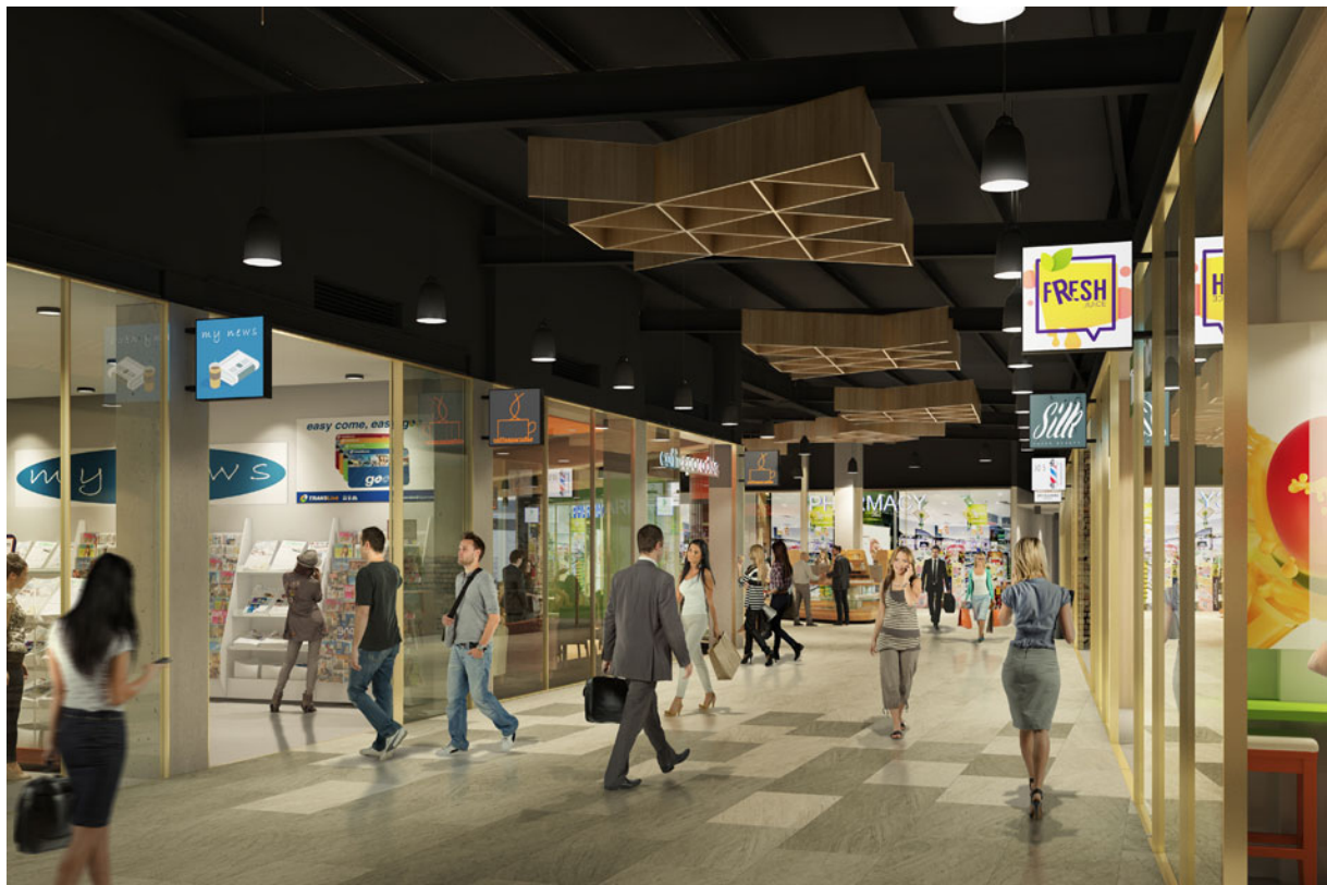
Artist's impression of a pedestrian connection to Alfred Street North (under construction)