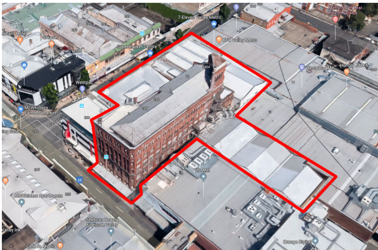
Outline of the Walton's building, Fortitude Valley.

After 35 years of being in the hands of the family-owned Mount Cathay investment company, the now run-down Walton's Building at 240 Brunswick Street was bought in April this year by Sydney fund manager Millinium Capital.