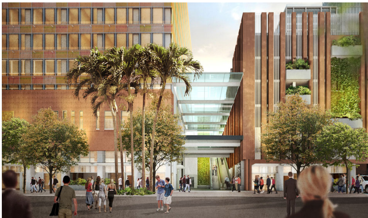
Artist's impression of potential future linkage to Alden Street

The development application number for this project is A005092336 .