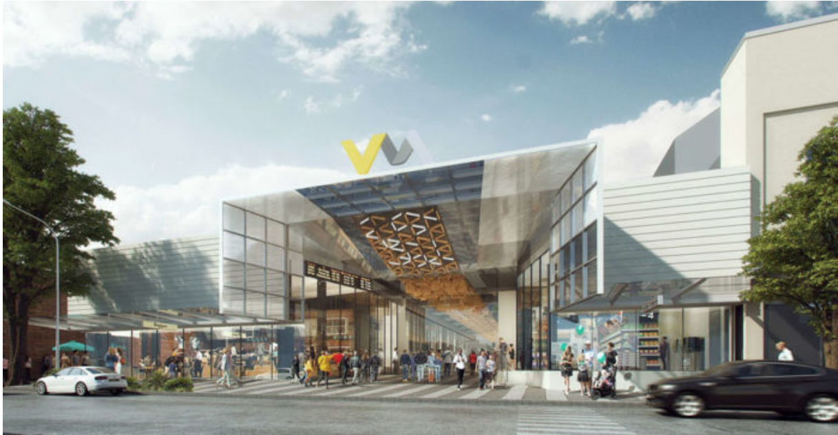
Artist's impression of approved Valley Metro retail centre