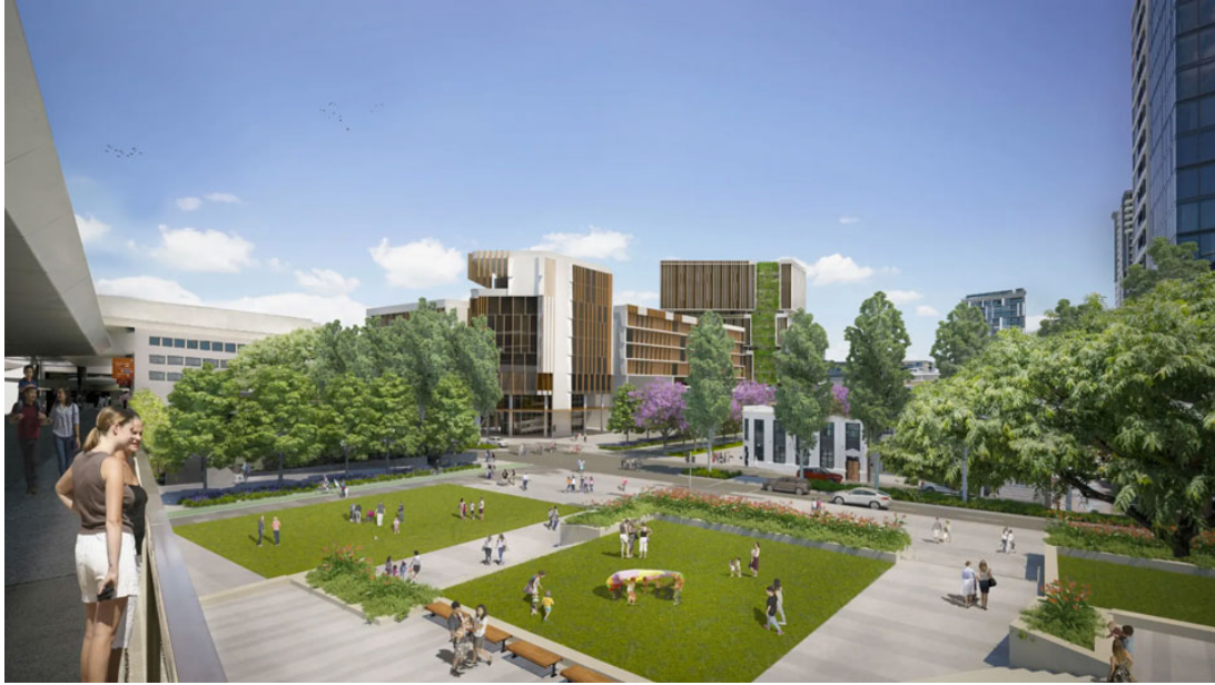
Artist's impression of the Queensland Government's plan for the Cultural Centre Precinct