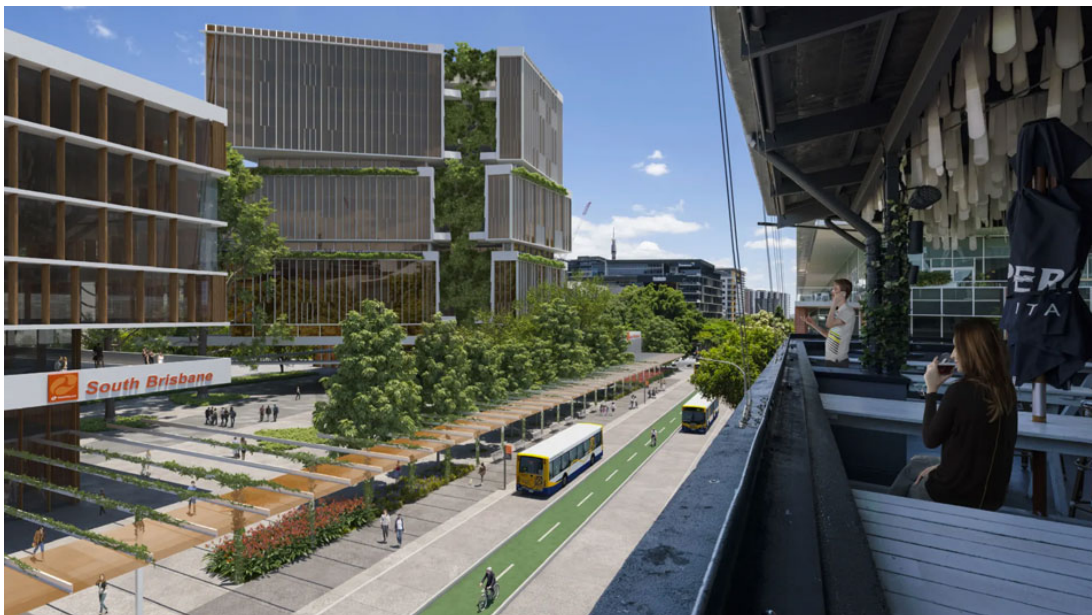
Artist's impression of the Queensland Government's plan for Melbourne Street