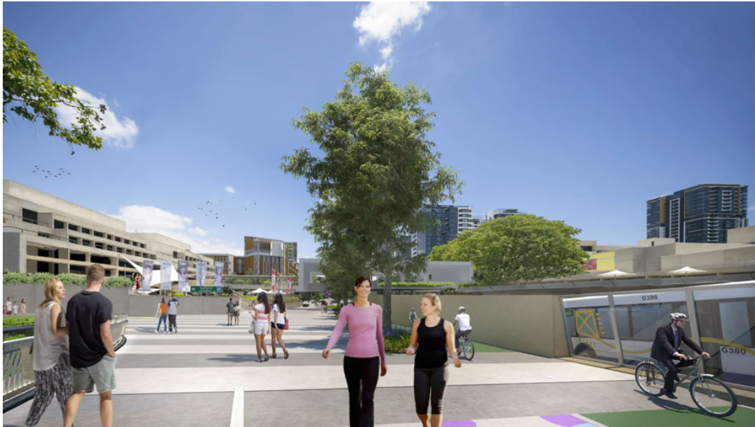
Artist’s impression of the Queensland Government’s plan the Cultural Centre Precinct

Artist’s impressions supplied by the Government show buildings lined along Melbourne Street along with where the former Brisbane Metro portal entry was proposed for.