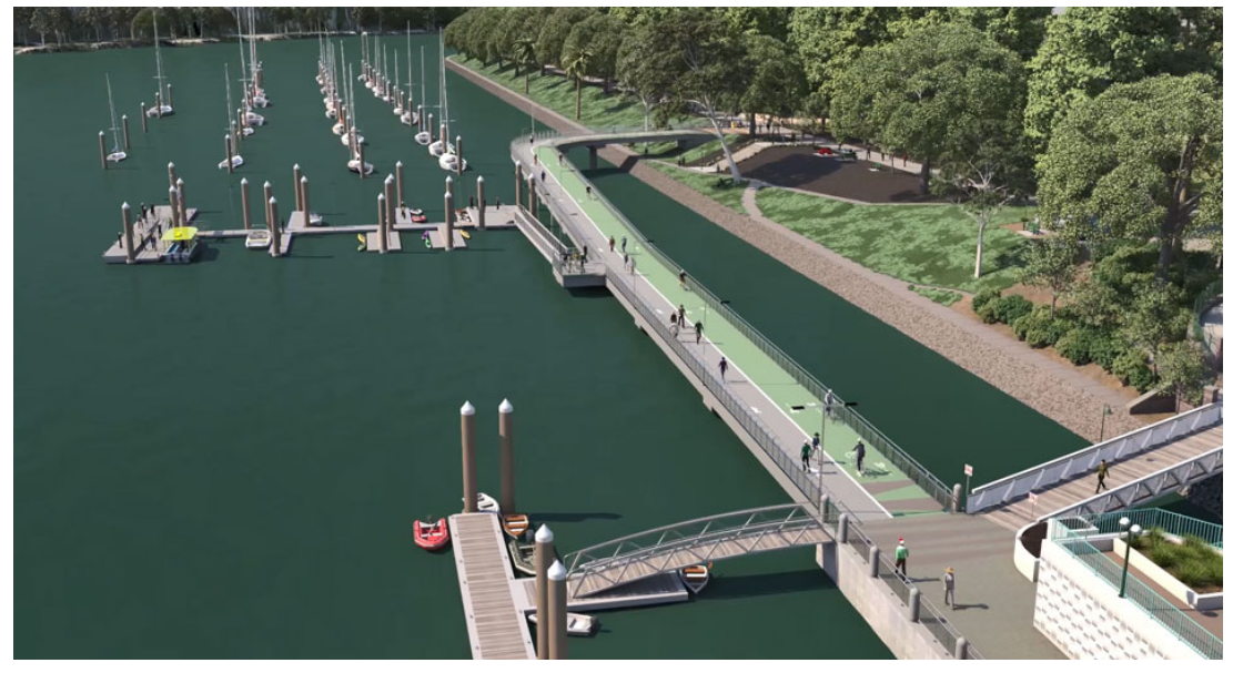
Artist's impression of new Botanic Gardens riverwalk project

"The intersection of Edward Street and Alice Street is a notorious missing link between New Farm and South Bank, with a narrow, winding path the only connector between the City Reach Boardwalk and the City Botanic Gardens.