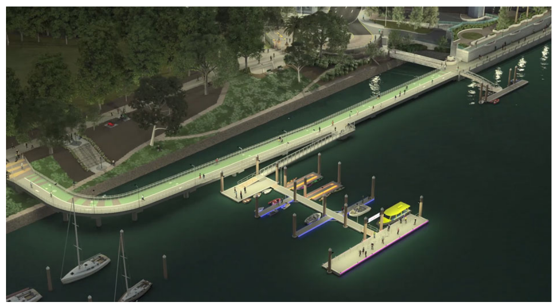
Artist's impression of new Botanic Gardens riverwalk project at night

"Vital investments such as this one enable residents and visitors to be fit and active, creating a brighter horizon for community health and wellbeing."