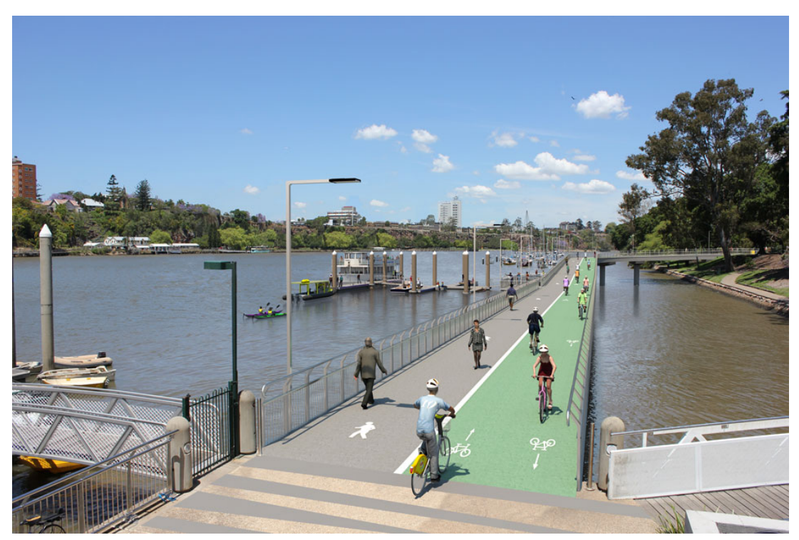
Artist's impression of new Botanic Gardens riverwalk project

"More than 3000 pedestrians and cyclists already use this path every day and many more will be able to make the most of our fantastic river lifestyle with the construction of the city's newest riverwalk."