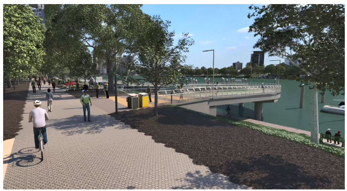
Artist's impression of new Botanic Gardens riverwalk project