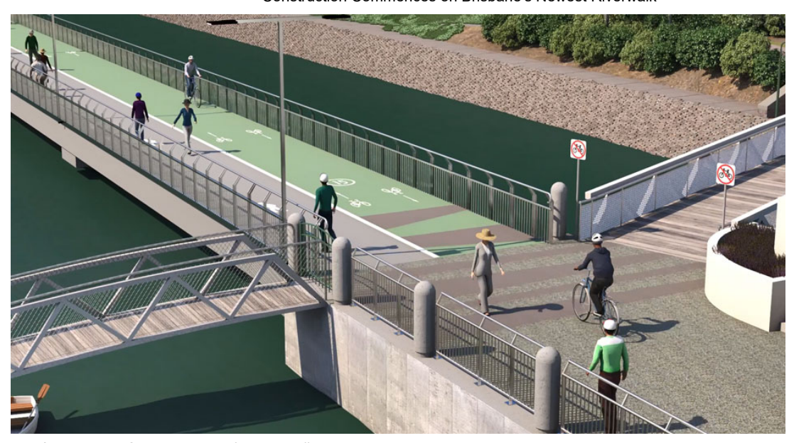
Artist's impression of new Botanic Gardens riverwalk project