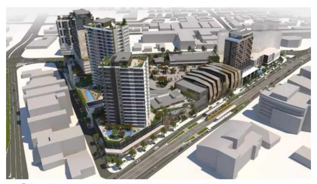
Queen Street Village artist impression.