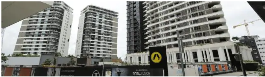
New apartment buildings going up in Teneriffe.