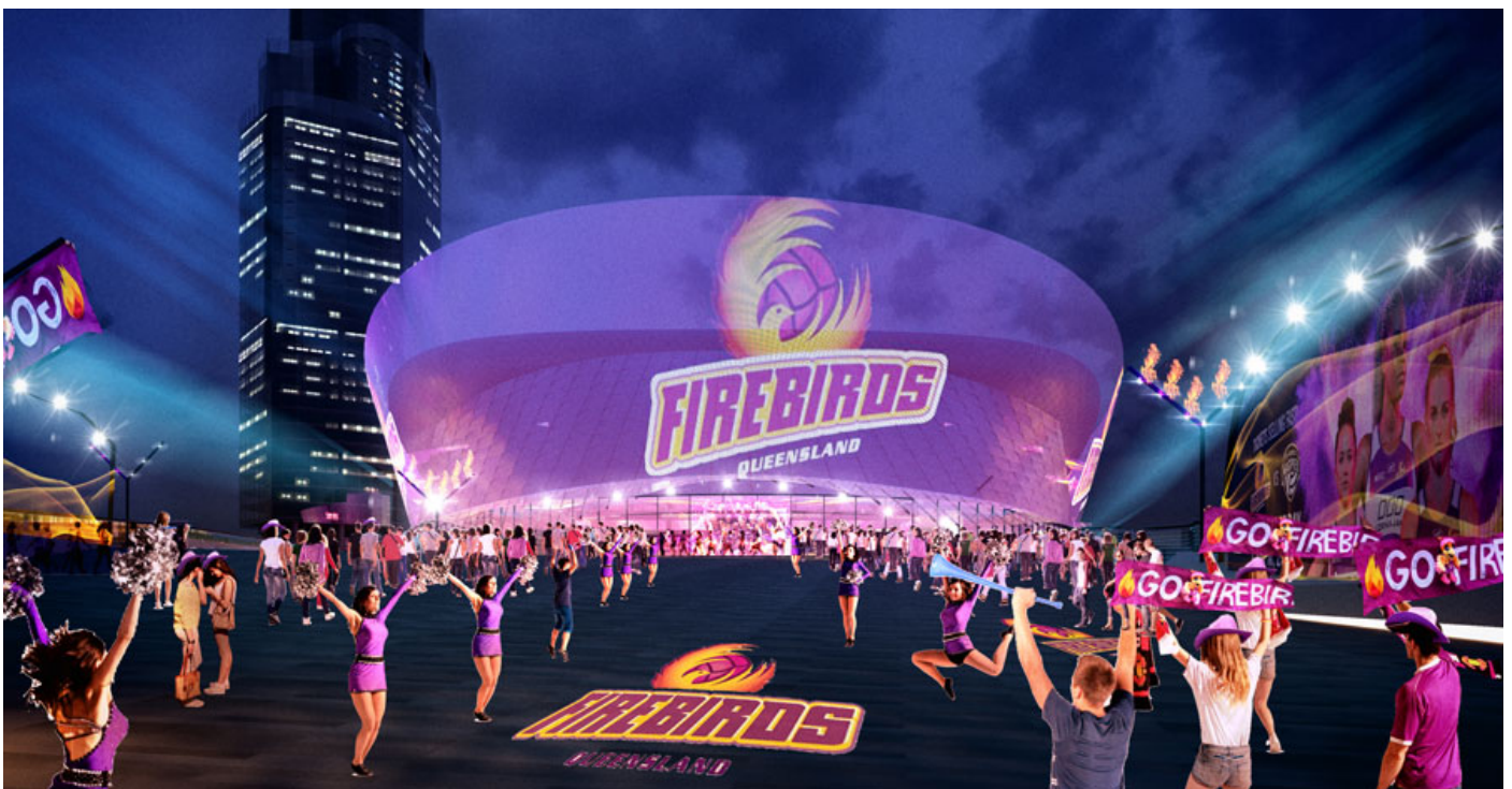
Artist's impression of Brisbane Live Arena's conceptual external screen

AEG has released new conceptual renderings showing a screen covered Arena facade, which is a supersized version of AEG's T-Mobile Arena in Las Vegas.