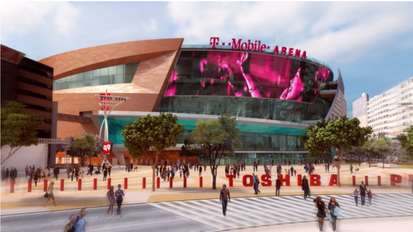
Artist's impression of AEG's T-Mobile Arena in Las Vegas