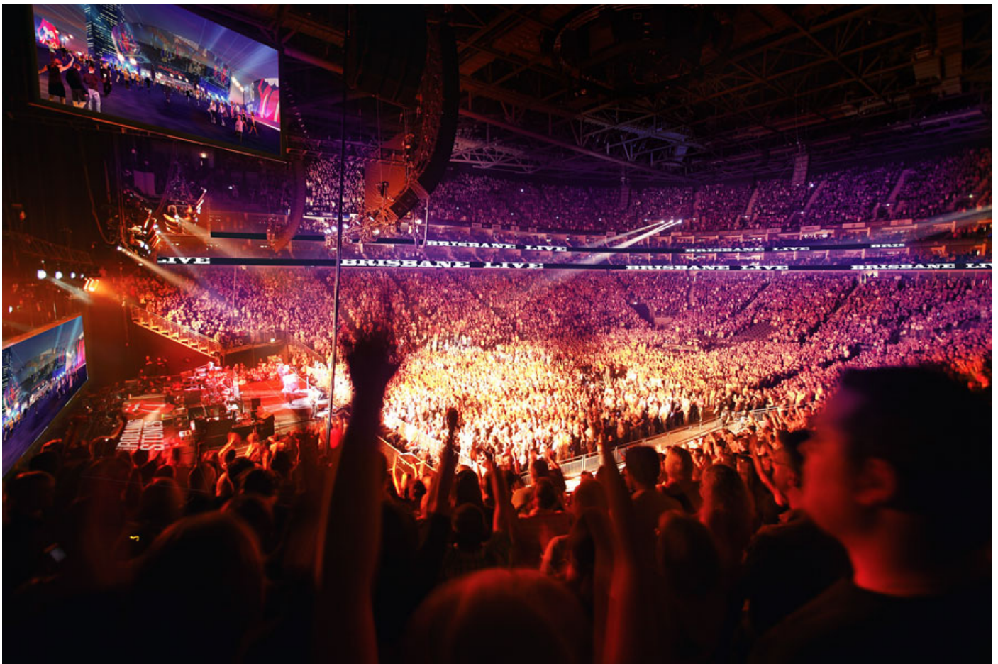
Conceptual rendering of the huge 17,000 seat Brisbane Live Arena interior

Along with the main $400 million entertainment arena, attractions that are also planned include outdoor amphitheaters, cinemas, restaurants, bars, hotels, and residences.