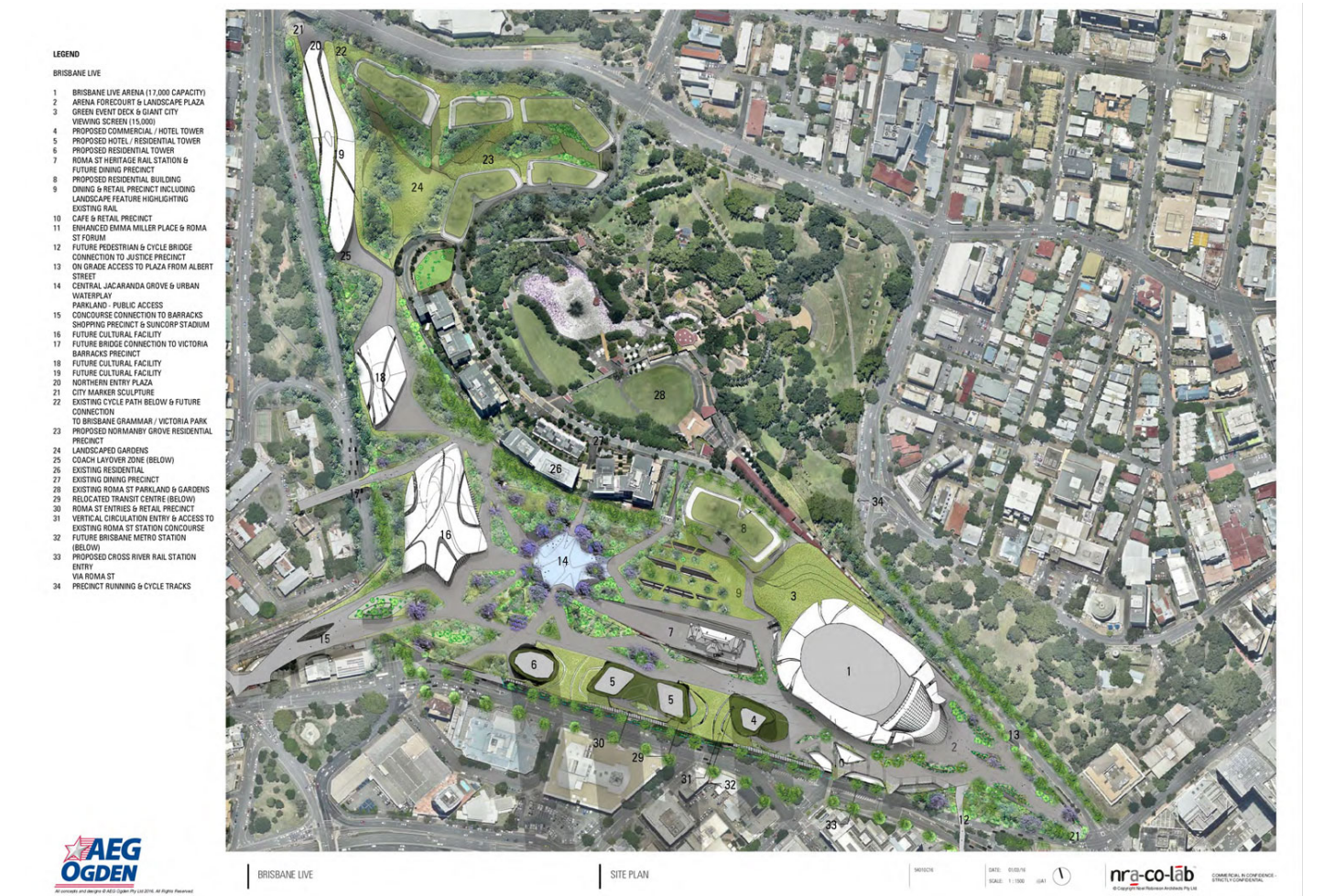
AEG's Brisbane Live Masterplan

It is understood that a new master plan is being drawn up in order to maximise the synergy and linkages of Cross River Rail and Brisbane Metro with the broader precinct.