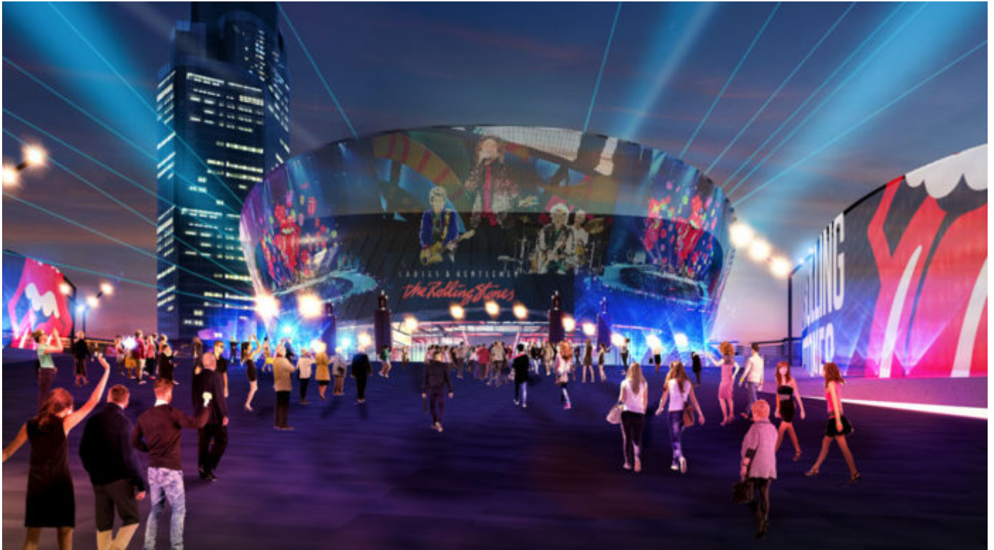
Conceptual rendering of Brisbane Live Arena

By Brisbane Development - November 12, 2017